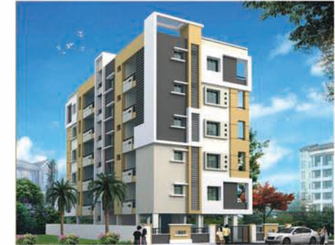
MAMATA RESIDENCY, LENIN ROAD, GANDHINAGAR, TENALI