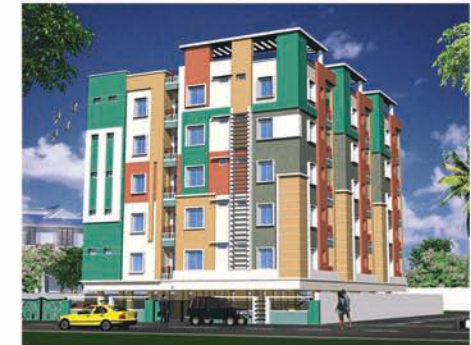
MAMATA REGENCY, SULTHANABAD, TENALI